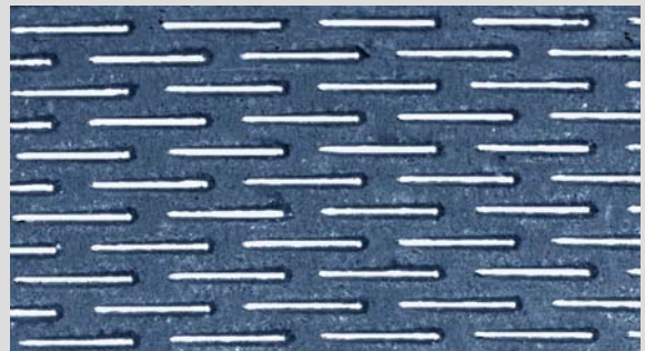
Stainless steel: 3,0 mm Slots: 3 mm x 180 µm, open area: 18%