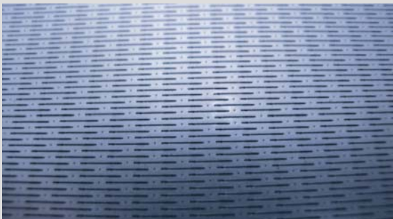
Stainless steel: 0,5 mm Slots: 5 mm x 150 µm, open area: 18%

With the new opportunities offered by fast beam deflection in modern perforation systems, we can produce various slot shapes by means of a defined beam spot.