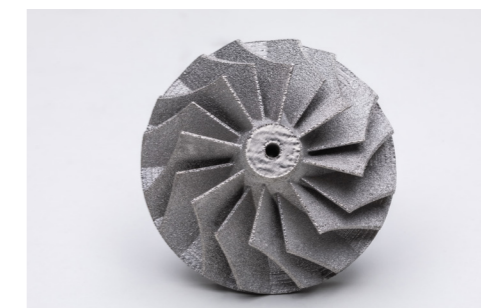
COMPONENT: Turbocharger MATERIAL: Titanium / as-built