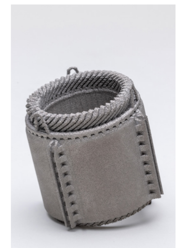
COMPONENT: Part of an electric engine (model) MATERIAL: Titanium / as-built