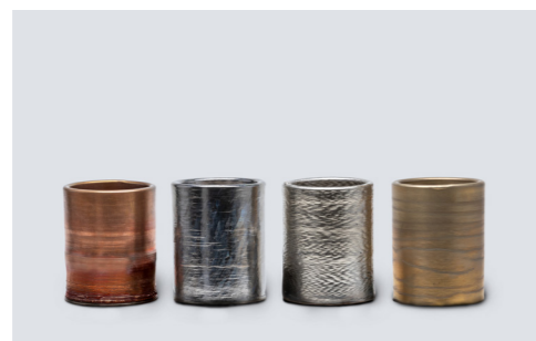
COMPONENT: Cylinder MATERIALS: Copper, titanium, stainless steel, copper alloy / as-built OUTER DIAMETER: 105 mm