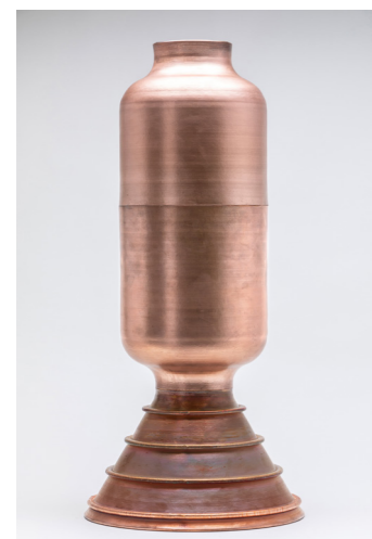
COMPONENT: Rocket propulsion (model) MATERIAL: Copper / as-built HEIGHT: 650 mm MAXIMUM DIAMETER: 295 mm

Using our digitally controlled process, all operations can be automated and reproduced.