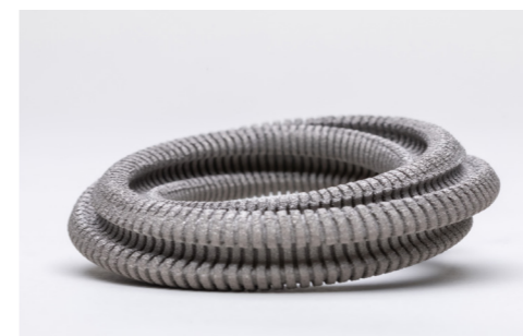
COMPONENT: Geometrical model MATERIAL: Titanium / as-built